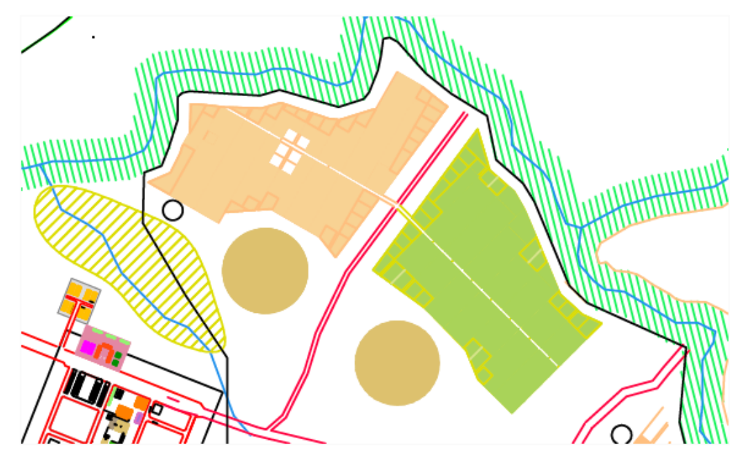
Village Layout with Agricultural Land