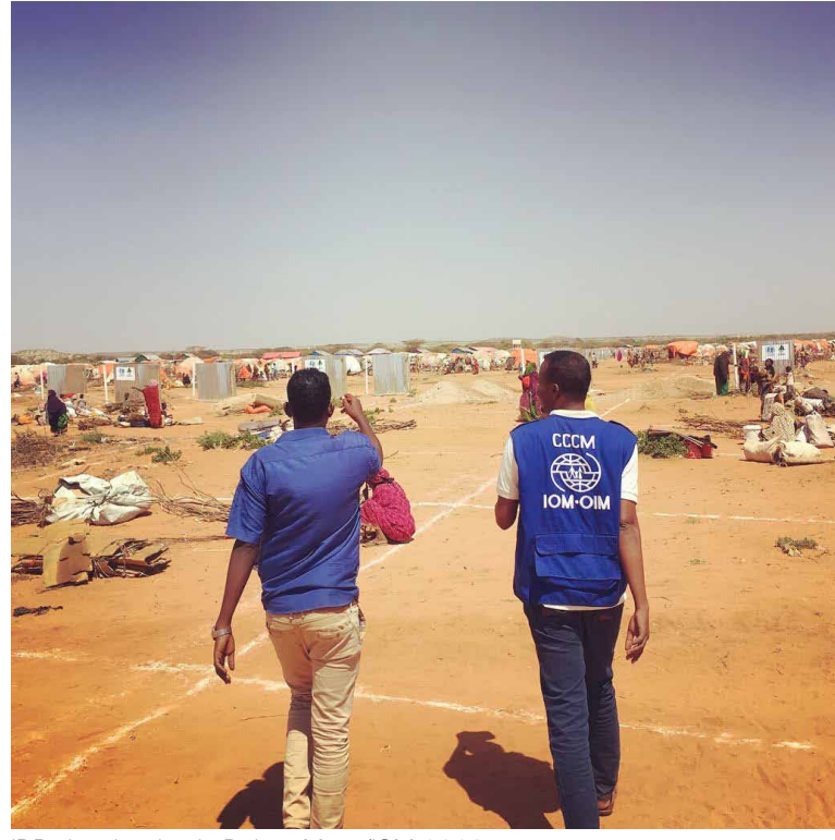
IDP site planning in Dolow, Muse/IOM 2018

Data collection for the Detailed Site Assessment is ongoing in 5 districts (2 in Bay and 3 in Galmudug).