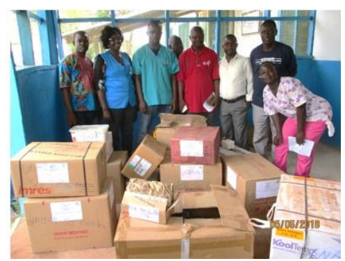
Drugs given to Kanneh Community Clinic by UNHCR. Present were Kanneh Community, Grand Gedeh CHT, LRRRC and UNHCR.