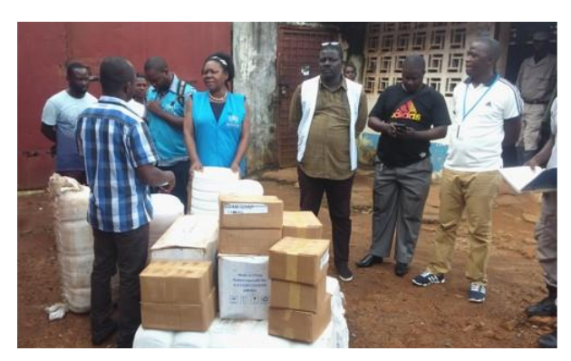
Donation at Maryland prison.

Refugees received tools for the tools bank, including 70 machetes, 10 pick axes, 22 shovels, 140 hoes, 13 files sharpeners, 45 rakes and 30 watering cans. The tools serve for cleaning