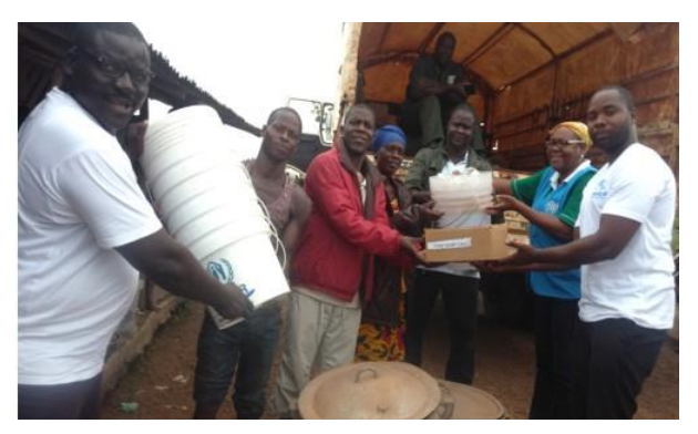
Presentation of materials to community leaders and host community.

www.unhcr.org Operational Portal Facebook 5