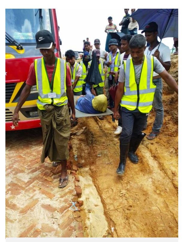
Trained refugee volunteers in high-visibility vests are assisting a person with specific needs relocate to safer area on 4 August.

During the reporting period, Protection Emergency Response Units (PERUs), an inter-agency emergency rapid response team under the framework of the Protection Sector Working Group led by UNHCR, remained on standby for quick deployment in close cooperation with key actors on the assess protection needs/risks, ground to psychological first aid, and make service referrals. Protection partners continued to support inter-sector efforts to relocate households at risk of landslides and flooding by identifying persons with specific needs and accompanying them to relocation sites.