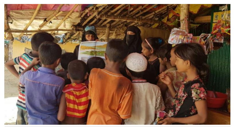
Refugee children take part in awareness raising on flood and landslide by trained members of the COMs refugee volunteer group.