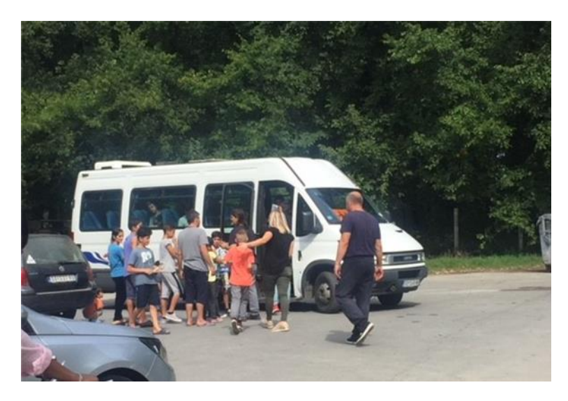
Refugee children from Reception/Transit Centre in Sombor on the way to school by bus provided by municipal authorities, Sombor (Serbia), ©UNHCR, 13 September 2018