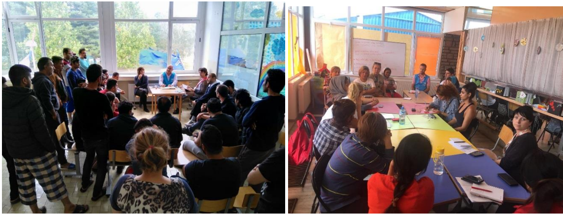
Focus Group Discussions with refugee and asylum seeking women and men at Bujanovac and Vranje RTCs