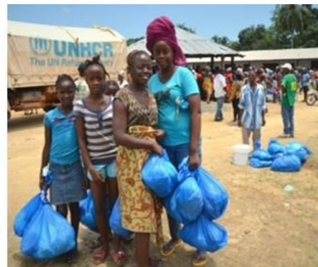
(L) NFIs in preparation for the distribution; (R) Some of the beneficiaries