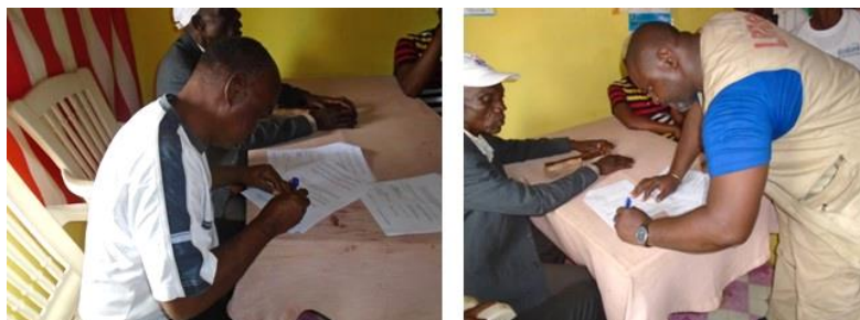
Signing ceremony of the MoU on land access for local integration