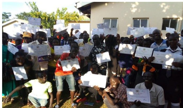
Youth participants pose for a photo upon receipt of 04 days youth consultative workshop attendance certificates issued after the conference session.