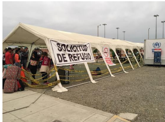
Arrival of Venezuelan asylum-seekers at CEPR tent at the Binational Border Centre (CEBAF) near Tumbes