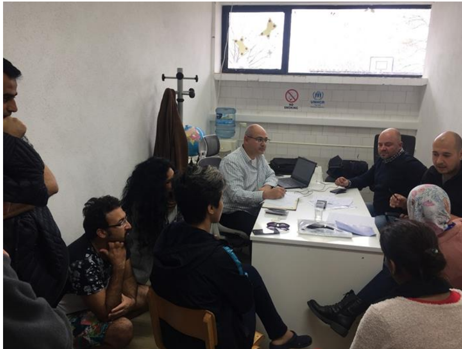
UNHCR and legal partner staff counselling residents of the Reception/Transit Centre Bujanovac on asylum procedures in Serbia, Bujanovac, 22 November 2018