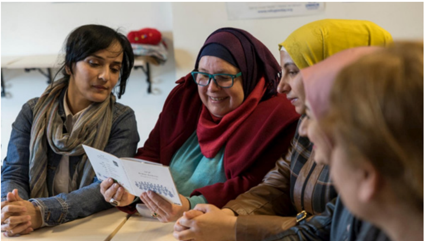
Women's solidarity group in Istanbul

which identified women working on the streets of Ankara, who are at heightened risk of SGBV due to their vulnerable socio-economic status. This included female heads of households, as well as families with one or more specific protection needs identified within the household. The women identified are supported through multi-sectoral interventions, including Turkish language classes, daily incentives to enrol children in child-friendly spaces, and enrolment in vocational courses. Ensuring self-reliance for women reduces their vulnerability to SGBV and enhances their prospects for integration.