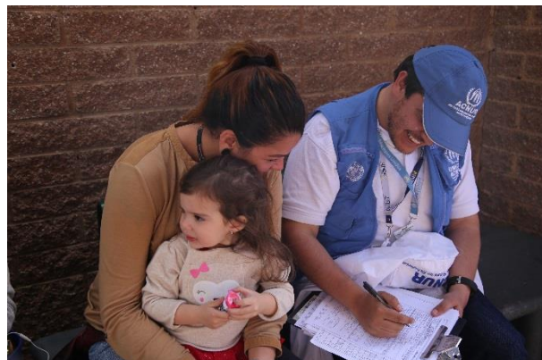
UNHCR staff supporting the registration of Venezuelans in Soacha, near Bogotá, June 2018.