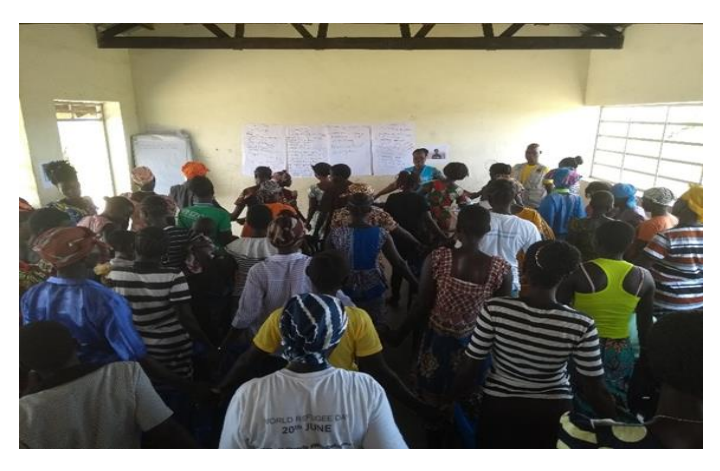
Training on Women Participation and Leadership in Imvepi Settlement, Arua