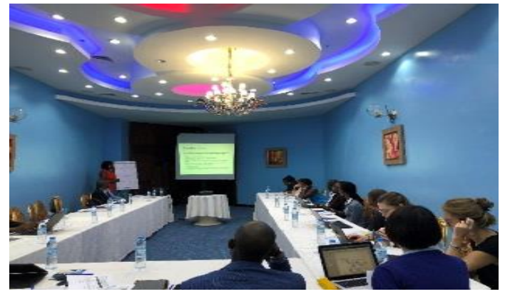
Meeting to validate the findings of the Inter Agency SGBV Assessment findings

PSEA: In Moyo, a PSEA training was held for 35 community structures (RWC, Women Reps, Religious Leaders, and Youth Reps). LWF also conducted PSEA training for 89 staff (33F, 56M) as part of action points agreed during the PSEA training conducted by UNHCR for all PSEA focal persons for all partners of Palorinya. In Arua, 25 trainings on PSEA targeting UNHCR staff members, partners, community workers and volunteers, interpreters and