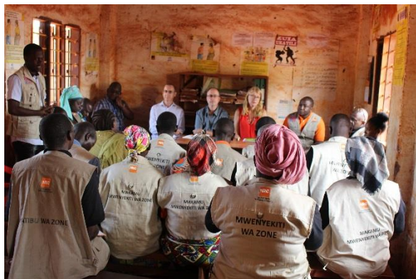
DFID Tanzania meeting with Burundian Refugee Zone Leaders in Nyarugusu Camp