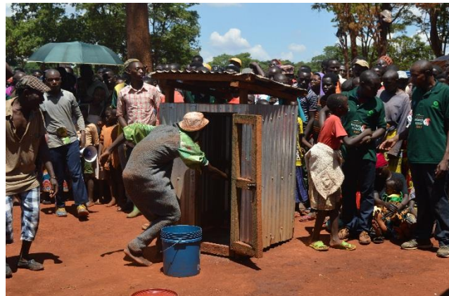
A refugee incentive working giving a demonstration on how to clean latrines in Nduta Camp