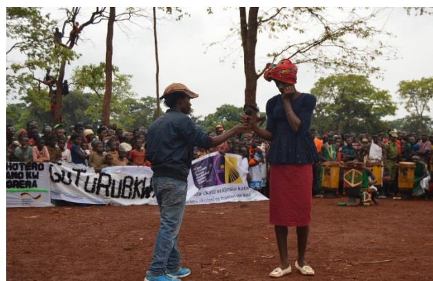
Burundian refugees perform a powerful play on how everyone can help end violence against women and girls

From November 25 to December 10, refugees came together to commemorate the annual 16 Days of Activism Against Sexual Gender-Based Violence. The theme of this year's global campaign was: "End Gender-Based Violence in the World of Work". A series of activities were held in Nduta, Mtendeli and Nyarugusu camps, including drama performances and traditional songs and dances highlighting the importance of eliminating violence against women and girls. UNHCR Kibondo staff also marked the day by printing their hands on a banner to pledge their commitment to eliminate all forms of discrimination and violence against women wherever they live or work.