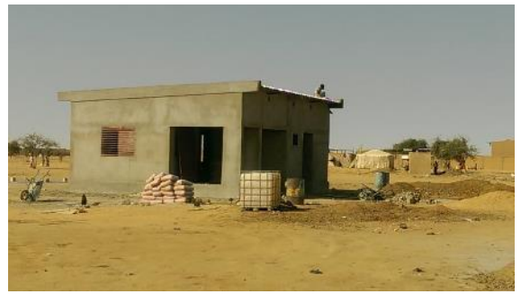
Construction of living quarters for doctor and midwife at Intikane health centre.

o The construction of 2 CSI Type II health centres for the Abala and Ayorou urbanized sites is ongoing.