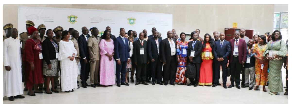
Abidjan - Participants to the regional meeting on durable solutions for Ivorian refugees from Cote d'Ivoire, Ghana, Guinea, Mali, Liberia, Togo and UNHCR staff from Regional Bureau and HQ