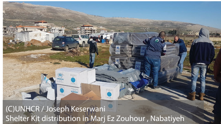
Shelter Kit distribution in Marj Ez Zouhour, Nabatiyeh

Partners involved in the response: Governor's office, CISP, AVSI, NRC, ICRC, PU-AMI, LRC-DMU, IRC, SHEILD, INTERSOS, TdHL, ACF Spain, UNDP, UNICEF, UNRWA, UNHCR, UNIFIL, WVI, DPNA, WFP, Mercy Corps, Caritas, Save the Children.