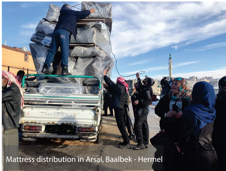
Mattress distribution in Aarsal, Baalbek - Hermel

574 Sites Affected 22,595 People affected