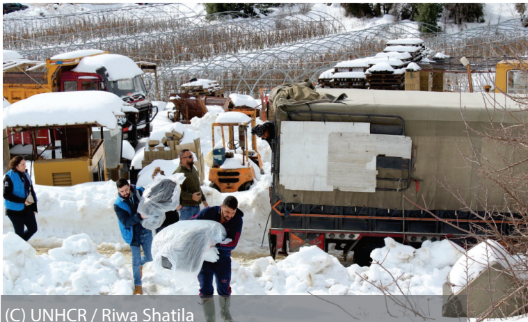
Mattress distribution in Bekaata, Mount Lebanon

Partners involved in the response: MoSA, MoIM, MoSDA, governors' offices, municipalities, UNHCR, UNDP, UNICEF, WFP, Concern WW, Solidarités, PU-AMI, Leb-relief, Save the children, Lebanese Red Cross, IRC, NRC, Caritas Lebanon, PCPM, MSF, ICRC, DAF, and URDA . Lebanese Armed Forces were distributing some relief items in coordination with the Lebanese Red Cross.