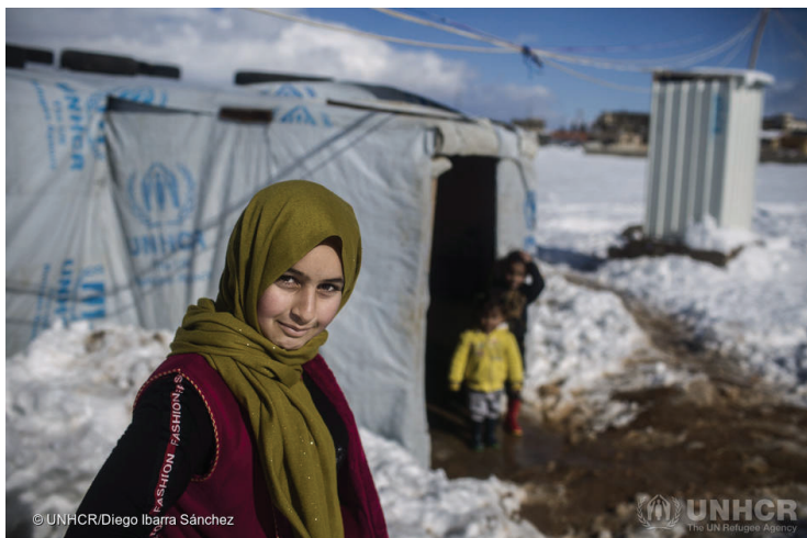
1 CNRS data

Providing assistance in some areas was slow or blocked. In Beirut Mount Lebanon, there were 11 sites in Choueifat, at risk of evictions that did not receive sealing off kits or core relief items due to municipality