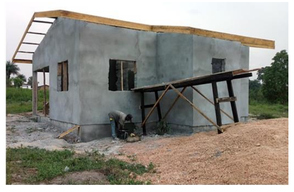
(L) UNHCR, AIRD & LRRRC joint site visit. (R) One of the 12 durable shelters.

www.unhcr.org Operational Portal Facebook 5