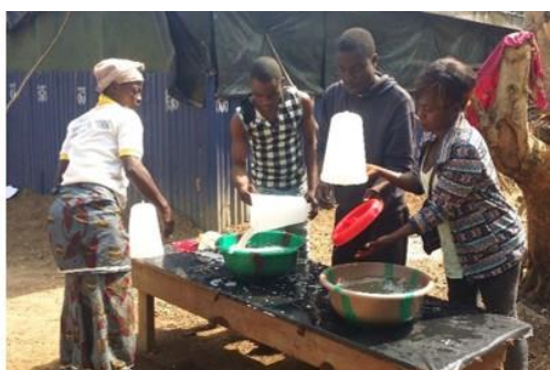
The project began in September 2018. Participants to the project include female-headed households and vulnerable households.