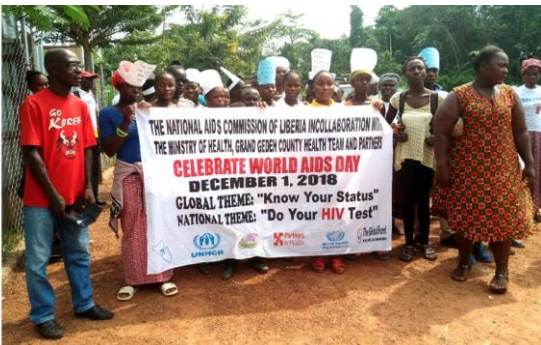
Celebration of World AIDS Day in PTP Camp under the theme "Know Your Status".