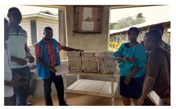
(L) UNHCR presenting 300 pieces of used zinc from decommissioned shelters of LWC. (R) JJ Dossen Hospital Administrator receives the donation for and un-behalf of the hospital.