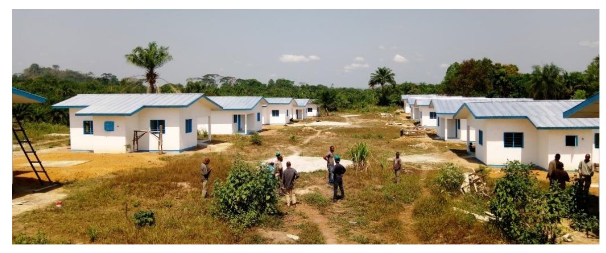
The 12 durable shelters in Bahn settlement are almost finalised.

The construction of the 12 durable housing units in Bahn settlement is in its final stages. The painting (interior and exterior) and the construction of the septic tank are finalised. UNHCR coordinates periodic site monitoring jointly with AIRD, LRRRC, contractors and refugees.