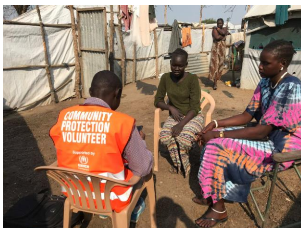
UNHCR partner HDC conducting an interview during a profiling exercise at Bor PoC site.

1 Branch Office in Juba 2 Sub Offices in Jamjang and Bunj 5 Field Offices in Yambio, Yei, Bor, Malakal, Bentiu 2 Field Units in Wau and Yida (as of 31 January 2019)