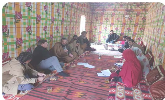
Meeting with male OVs and focal points at Miani Bazar Buchal Khurd