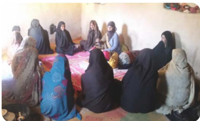
Female community session Posti refugee village @ UNHCR/ Quetta / Baluchistan