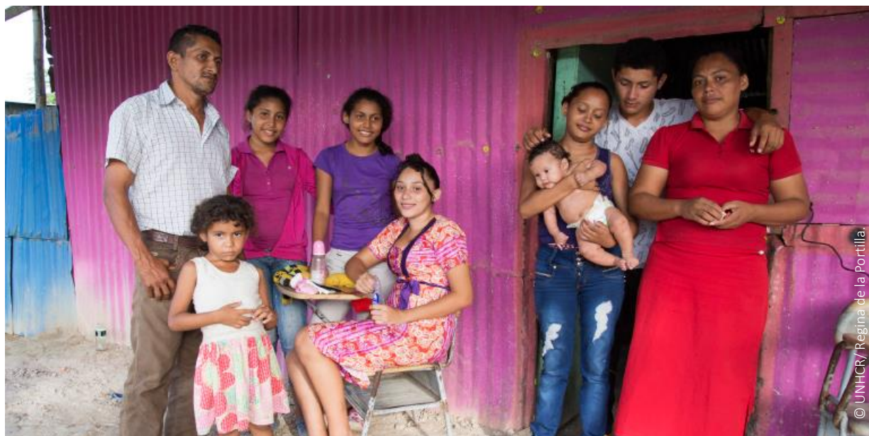
A Venezuelan family lives in an informal settlement in Arauca while they wait for information on their refugee status.

The Interagency Group for Mixed Migration Flows (GIFMM in its Spanish acronym) was created at the end of 2016 to respond to the increasing flow of people arriving from Venezuela. The group coordinates the national response to the situation of refugees and migrants, Colombian returnees and host communities in Colombia, complementing the response of the Colombian government. It is co-led by the International Organisation for Migration (IOM) and the United Nations High Commissioner for Refugees (UNHCR). It currently has 50 members, including international NGOs, UN agencies and members of the Red Cross Movement.