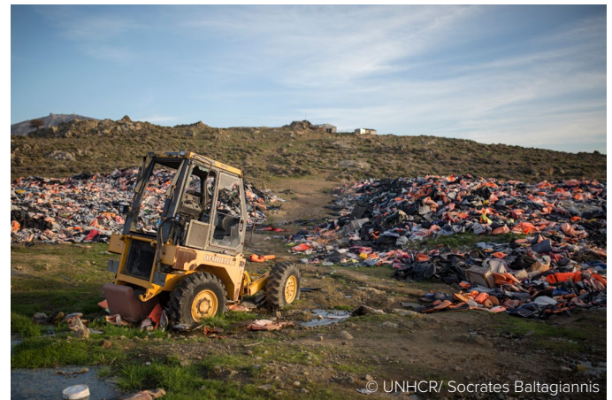
Piles of lifejackets used by refugees and migrants to cross the Aegean Sea from Turkey to Greece are seen at a dumping ground near the town of Molyvos on the Greek island of Lesbos.

several incidents at sea. Two four-year old boys and their father lost their lives in a shipwreck near Samos of a boat that carried twelve people from Afghanistan. The mother of the family was amongst the eight survivors. On 14 March, a boat carrying 67 refugees and migrants sank while attempting to cross the Western Mediterranean from Morocco to Spain: the Moroccan Navy rescued 22 persons, including seven pregnant women, while 45 persons were reported missing. Also, on 23 March, 41 refugees and migrants were reported missing while crossing to Europe through the Central Mediterranean.