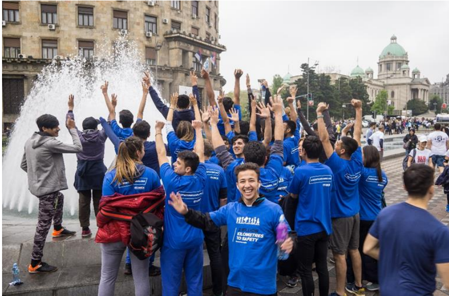
Refugee youth at the Belgrade marathon, 12 April 2019