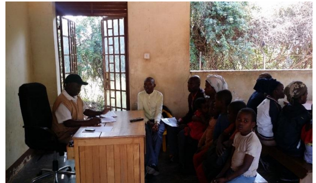
1 st REC session in Nakivale settlement