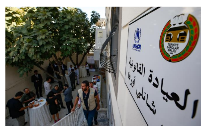
Şanlıurfa Legal Clinic was established in 2018 to offer legal assistance to refugees and asylum seekers.

To strengthen the provision of legal aid for refugees and asylum-seekers, the Union of Turkish Bar Associations (UTBA) and UNHCR continued to provide support to 18 bar associations. Some 300 cases were submitted for legal aid appointments through a custom developed automated approval system . The cases mainly concern applications to administrative and civil courts, including first instance and appeal stages as well as oral and written counselling. The appointments were made for individuals of 22 different nationalities, the majority of which concerned Syrian nationals, followed by Afghan, Iranian and Iraqi nationals.