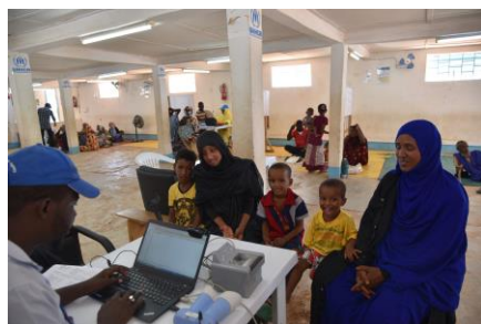
UNHCR staff assisting a Malian refugee family during the registration process in Mbera camp