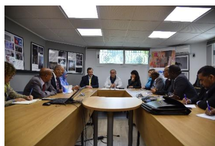
The Mauritanian delegation during the meeting with UNHCR Special Envoy for the Mediterranean Situation