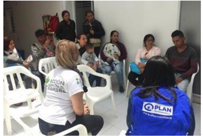
Un taller en Bogotá sobre salud sexual y reproductiva con venezolanos recién llegados, en el Centro Integral de Atención al Migrante / ACH

200,593 people benefitted from food assistance activities during the month, including hot meals at community kitchens, in kind food contributions and vouchers. The majority of these beneficiaries were in departments along Colombia's borders with Venezuela and Ecuador.