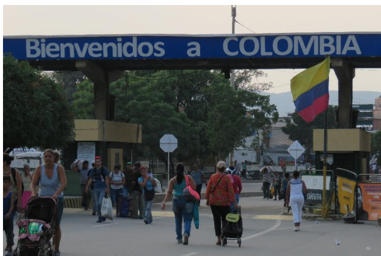
Actividad en el Centro de Atención Temporal al migrante (CATM) en Villa del Rosario, Norte de Santander