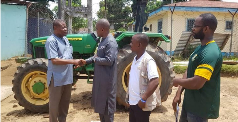
UNHCR Head of Field Office Zwedru presents the donated tractor to the President of Tubman University.