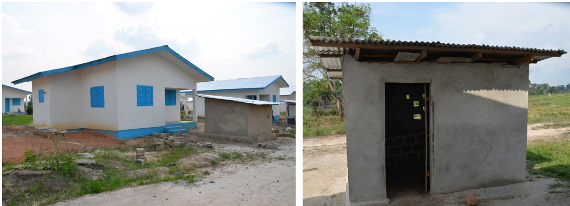
(L) Durable shelter and the outdoor kitchen. (R) Kitchen constructed by the refugee families allocated the 13 durable shelters. UNHCR provided 10 zinc sheets per family and technical support.