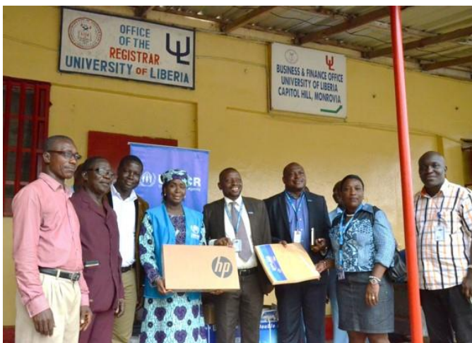
UNHCR Liberia Representative and team during the donation of items to the University of Liberia.