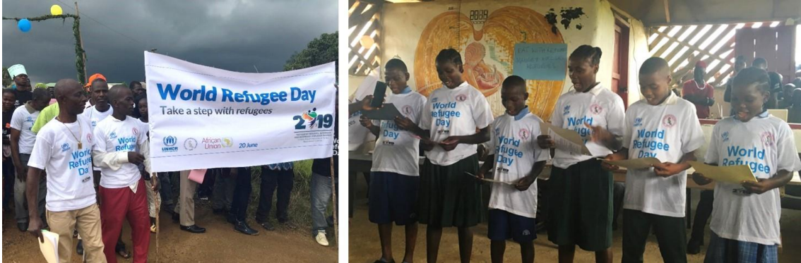
(L) Ivorian refugees led the parade on WRD. (R) Refugee students reading their poems.