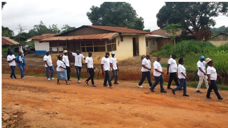
UNHCR colleagues took a step with refugees for more than 5 km in Monrovia and Zwedru.