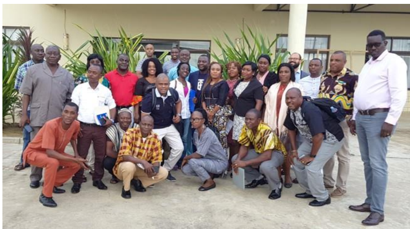
Participants of the programme management training in Monrovia.