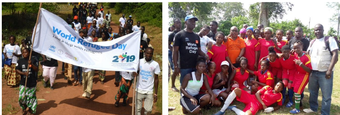
(L) Ivorian refugees in PTP Camp during the parade. (R) Refugees and members of the host communities after the soccer match.