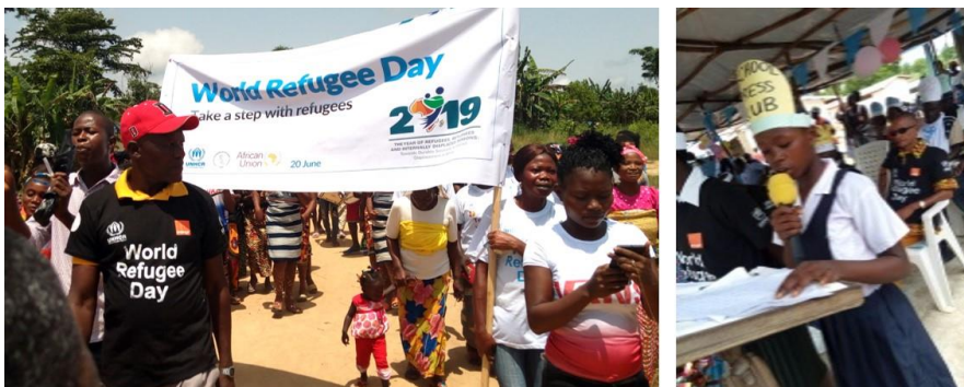
(L) Ivorian refugees in Bahn Camp celebrated WRD through a parade and (R) an indoor programme, including the participation of students and host community members.