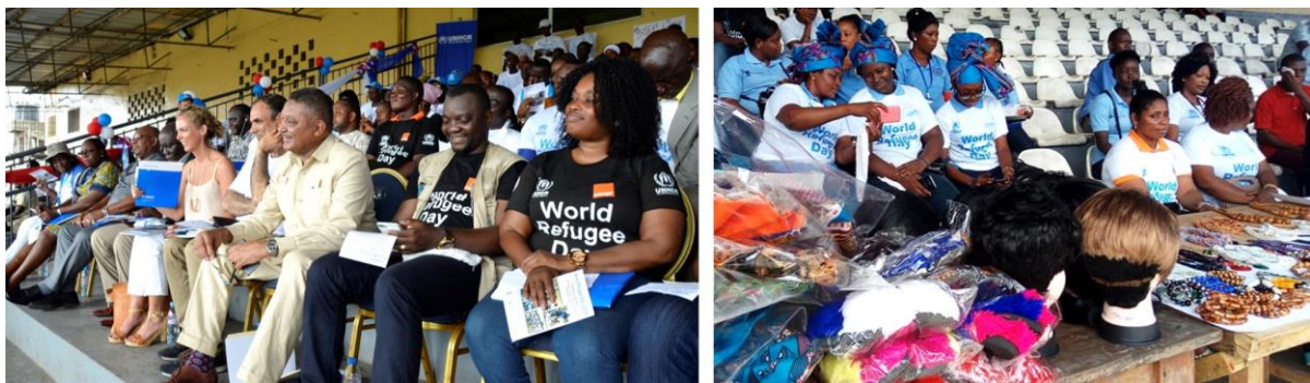
(L) High level participants, including the UN Resident Coordinator (centre), during the WRD celebration in Monrovia. (R) Liberian returnees displayed their products during the celebration.