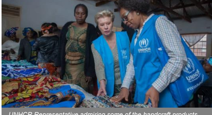
UNHCR Representative admiring some of the handcraft products

UNHCR through its partner Churches Action in Relief and