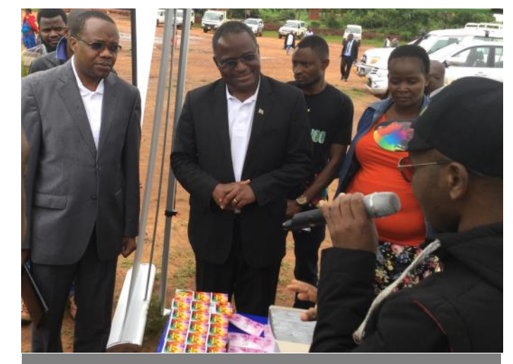
Acting WHO Representative (L) and Chief of Health Services listening to Population Services International officer elaborating on cancer services they offer.

"The country should now focus more in having pathology