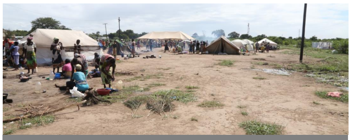
One of the displacement camps that was set up after the floods caused by Cyclone Idai.

United Nations agencies, in collaboration with the government of Malawi, as well as national and international organisations, have reached over 730,000 persons affected by the impact of Cyclone Idai. The flood-affected populations have received immediate life-saving relief support, including food, clean water, medicine, shelter, protection services, and other non-food-items such as sanitation and hygiene supplies.