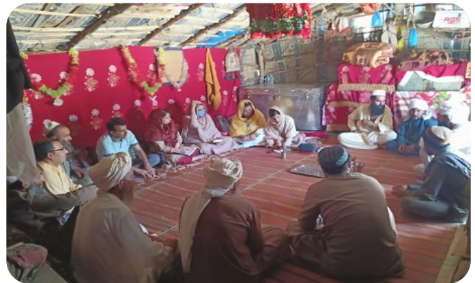
Meeting with community and outreach volunteers Attock, Punjab