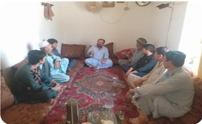
Meeting in Bashir Chowk Quetta, Balochistan.