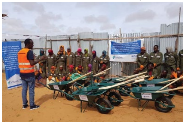
Site maintenance tool distribution to IDP site maintenance committees in Mogadishu Daynille and Kaxda, NoFYL/August 2019

102 vulnerable households at risk of eviction have been relocated by CCCM partners to Wadajir settlement in Galkayo. All families have received permanent shelters and land titles from the authorities. A total of 1,152 households are targeted for relocation and to benefit from permanent shelters and land titles in Wadajir.