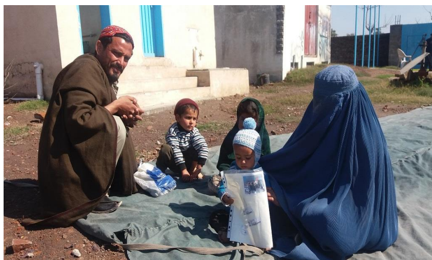
An Afghan family is waiting for processing at the Voluntary Repatriation Centre in Azakhel in the province of Khyber Pakhtunkhwa, Pakistan.

One Country Office in Islamabad Two Sub-Offices in Peshawar and Quetta Presence in Haripur, Kohat, Karachi