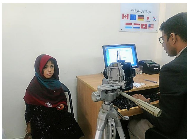
A child is being registered at the Proof of Registration Card Modification Centre in Rawalpindi, Pakistan.

2,145 persons (Afghan refugees and Pakistani nationals) received livelihood assistance