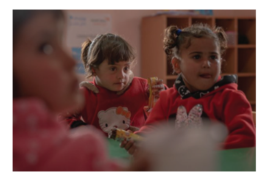
* Case Study provided by WVI.