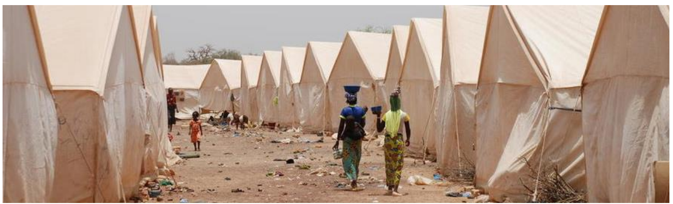
Barsalogho IDP site