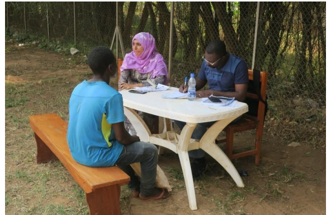
The REC session at Nakivale settlement