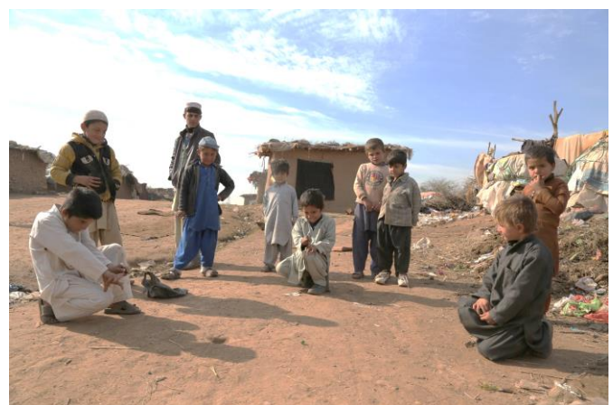
Afghan refugee children playing in the I-12 Afghan settlement in Islamabad.