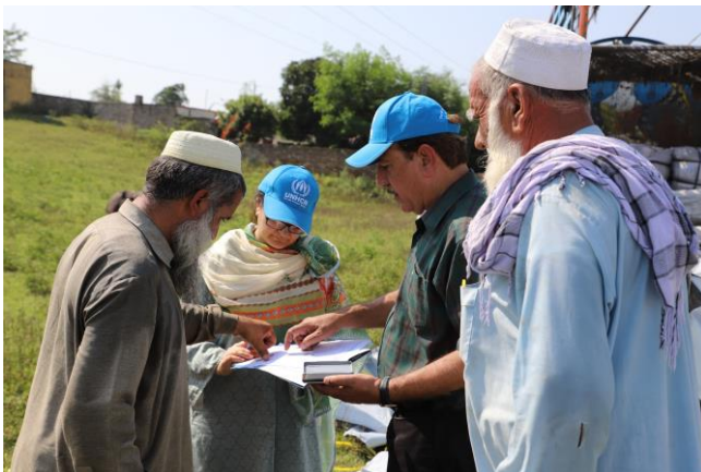
UNHCR Pakistan assisted 60 Afghan families in Mirpur, who were affected by the powerful earthquake in Pakistan-Administered Kashmir and other cities in the Punjab and Khyber Pakhtunkhwa provinces on 24 September 2019.

2,145 persons (Afghan refugees and Pakistani nationals) received livelihood assistance