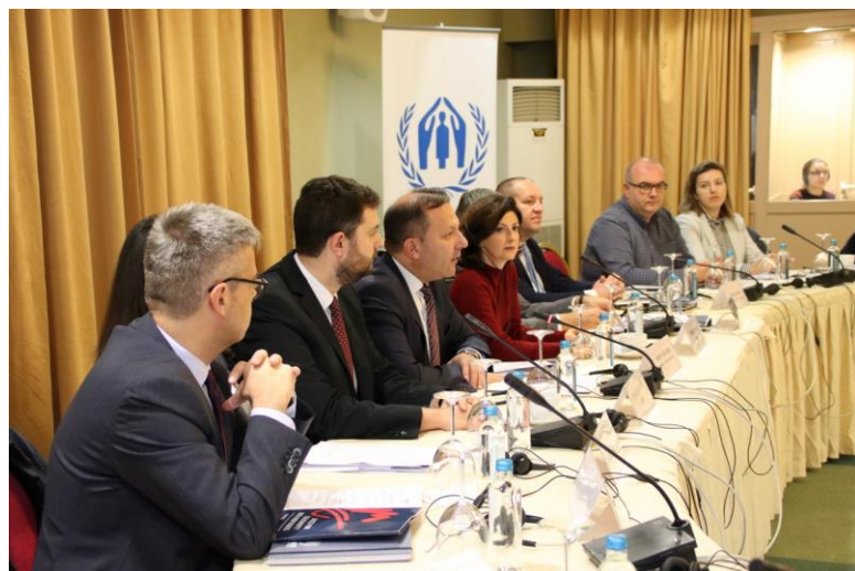
Future challenges in migration management conference organized by partner organization Macedonian Young Lawyers Association 27 November 2019, Skopje

1 Representation Office in Skopje, with daily field presence in Tabanovce, and 1 Field Unit in Vinojug Reception and Transit Centres