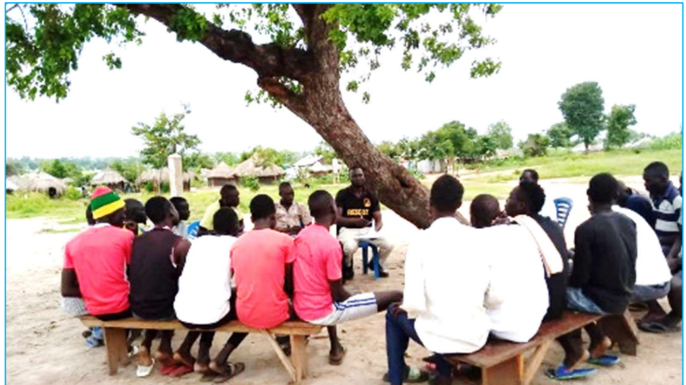
A men's group during an EMAP session in zone 5, Bidibidi settlement.