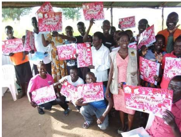
SASA! Community activists in Bidibidibidi receive communication materials