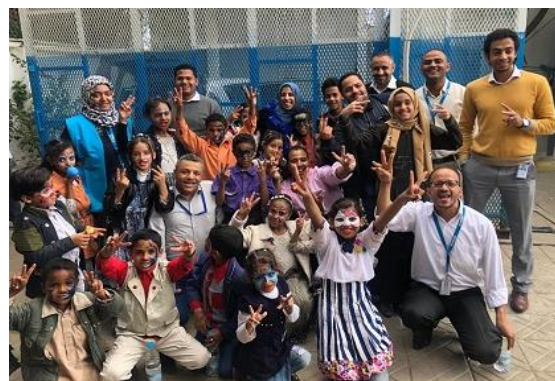
A celebration of Universal Children's Day (20 November), at the UNHCR Office in Sana'a, with children from displaced and hosting families.

In Hajjah Governorate, north of Al Hudaydah, UNHCR is constructing 3,200 transitional shelters for people who fled to Abs and have been living in poor conditions. The new shelters are being set up in Abs, in the coastal plane, 140km north of Al Hudaydah and 60km from the border with Saudi Arabia. Adapted to the hot local climate, they have roofs made of thatched grass over a layer plastic sheeting, using a design which allows for airflow and reduces temperatures inside. The construction of 800 of the shelters has been completed, while another 500 are already underway.