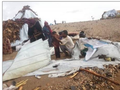
A displaced family near their damaged tent at one of the hosting sites in Aden. Heavy rains recently hit Aden and 11 other governorates (out of the 22 in Yemen).

Despite some improvement in the weather conditions since recent storms raged across Yemen, logistical challenges are hampering UNHCR's ability to respond to displaced (IDP) families in the southern governorates of Ibb and Taizz, especially in Taizz where main roads have suffered extensive damage. Local authorities report that preliminary assessments identified more than 1,890 families affected by the recent floods. Following Field Office Ibb's month-long ongoing request, local customs have released 1,600 core-relief items (CRIs). The distribution of these stocks will start as early as next week for the families in Al Dhale'e, Ibb and Taizz.