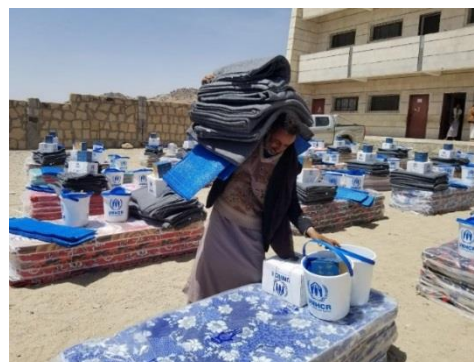
A displaced man receives basic UNHCR assistance kit Rajuzah district of Al Jawf Governorate.

Cash remains at the forefront of UNHCR's assistance in Yemen. In 2018, UNHCR assisted close to 800,000 Yemenis (and 130,000 refugees), disbursing USD 48 million. By monitoring new displacement and working with service providers, community centres and local leaders, UNHCR and its partners are able to identify and assess the needs of vulnerable households. During the reporting period, 16,753 IDP families received cash assistance to address their protection needs, including rental subsidies. Distributions were made in the northern border areas of Sa'ada and Al Jawf (3,552 families), to families at the flash point of Hajjah governorate (5,601 families), and to those in Hudaydah governorate (4,048 families). According to the 2019 Humanitarian Needs Overview, an estimated 43 per cent of IDPs outside hosting sites are living in rented accommodation.