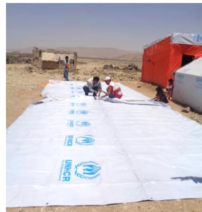
UNHCR partners prepare plastic sheeting, part of the emergency shelter kit package, to be used on a tent at the Kharif IDP hosting site, Amran Governorate.

UNHCR continues to deliver emergency core-relief items (CRIs) to internally displaced families (IDPs) in Taizz governorate, where the southern frontlines run horizontally through the region. Taizz governorate houses the second highest number of IDPs (68,625 families) and returnees (24,721 families) in the country. This week, as a response to this continuous flow, some 450 IDP families in various districts received CRIs/emergency shelter kits (ESKs). During the reporting period, CRIs were provided to 458 IDP families in Hays district, south of Hudaydah governorate that neighbours Taizz governorate. There are 26 districts in Hudaydah, with IDPs scattered across all areas, the highest number being recorded in the southern Zabid district (8,203 families) followed by the northern tip of Az Zuhrah (5,713 families) which also borders Abs district, Hajjah governorate, to the east.