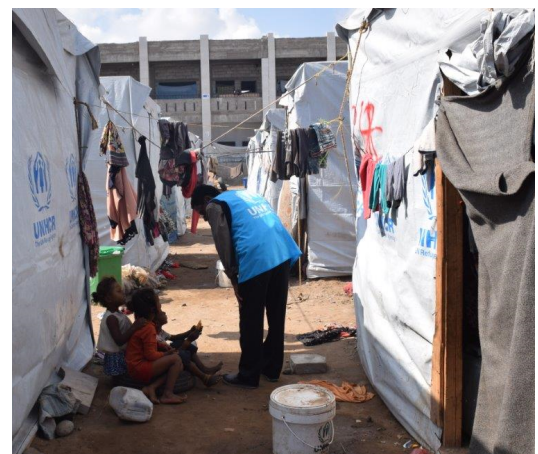
UNHCR transitional shelters in Aden in December 2018, housing families displaced from fighting in Al Hudaydah.

UNHCR continues to identify, upgrade and repair sub-standard shelters rented by refugees. Rented shelters are being improved to benefit refugee tenants and Yemeni host communities as part of the Basateen Roadmap project to improve living conditions and foster social cohesion. Basateen is a neighbourhood on the outskirts of Aden, where a large number of vulnerable refugee families are living. In 2018, UNHCR made improvements to 190 homes in Basateen that are rented by refugees, and a further 300 will be repaired or upgraded in 2019.