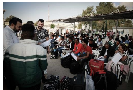
Distribution of travel documents at the GDF prior evacuation.

On 10 December, 28 individuals from Eritrea, Sudan, and Somalia were transferred out of the GDF after agreeing to accept an urban package of assistance at the Community Day Centre (CDC). The transfer included 25 men, two women and one child. This is the fifth transfer to have taken place in December. Individuals were provided with core-relief items (CRIs), medical assistance and cash grants, to help them meet their basic needs such as shelter and food. Since October, a total of 174 individuals, previously hosted at the GDF, have been transferred to the urban community in nine separate operations. The GDF is currently host to some 1,050 people, of whom nearly 400 are former detainees of the Abu Salim detention centre, having entered the facility en masse last October. A similar number of ex-detainees from the Tajoura detention centre also are being hosted at the GDF, following an airstrike in July.