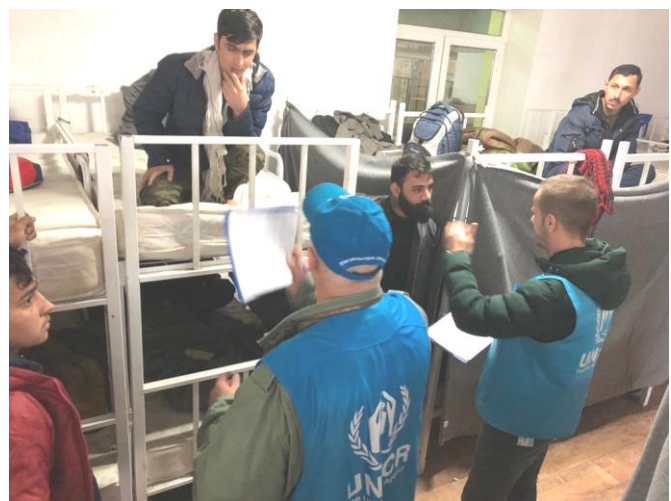
Profiling new arrivals in Preševo Reception Centre, ©UNHCR, December 2019

CO in Belgrade and FU in South Serbia for regular protection monitoring in five Asylum Centres and 25 other sites across the country