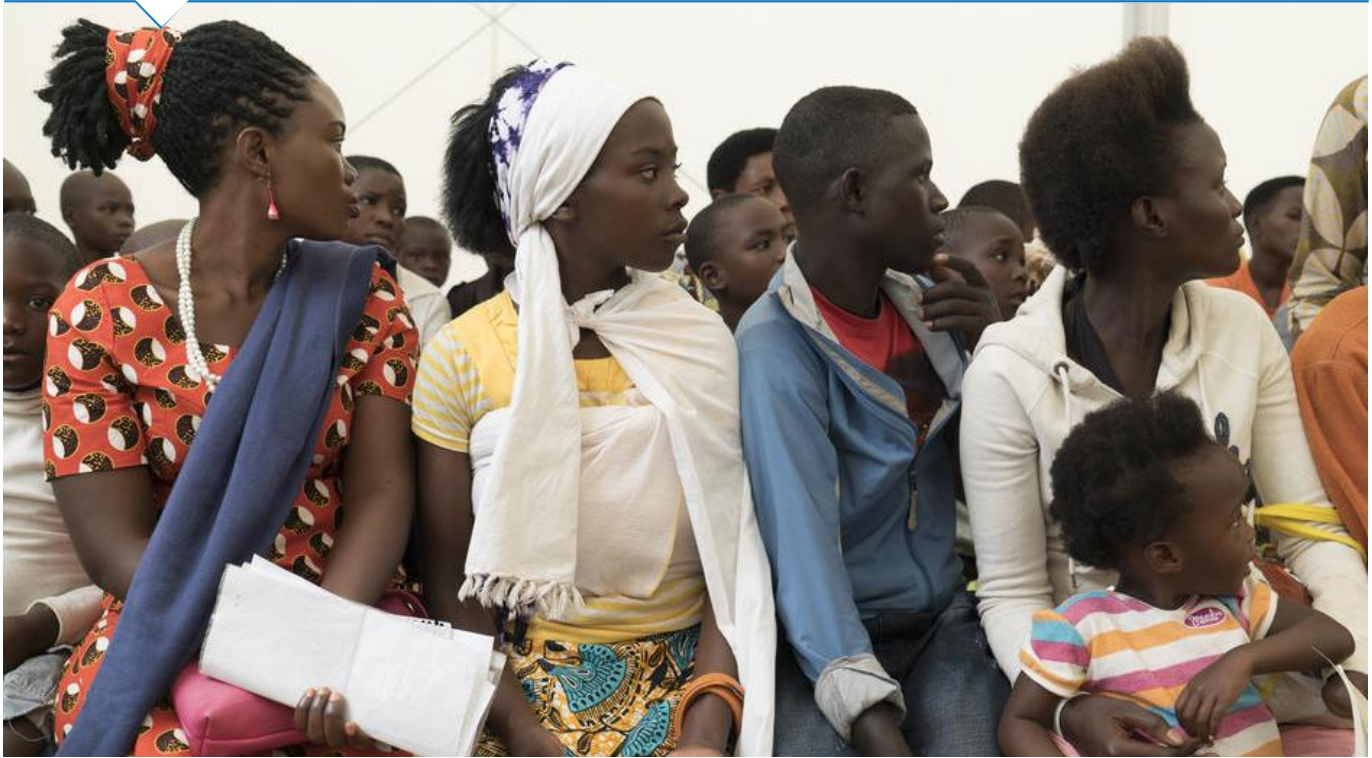
Biometrics verification in Uganda