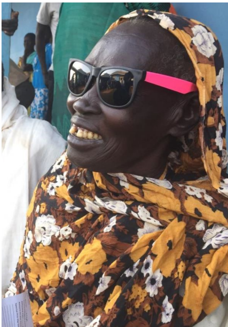
An 80-year-old refugee from Sudan rests after following cataract surgery in Maban, Upper Nile. The surgery restored her sight.