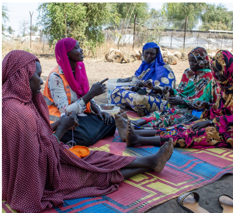
A youth protection monitor with UNHCR partner Danish Refugee Council leads an awareness raising session on the harms of female genital mutilation in Maban County, Upper Nile.

1,064 persons of concern reached through child rights and protection campaigns